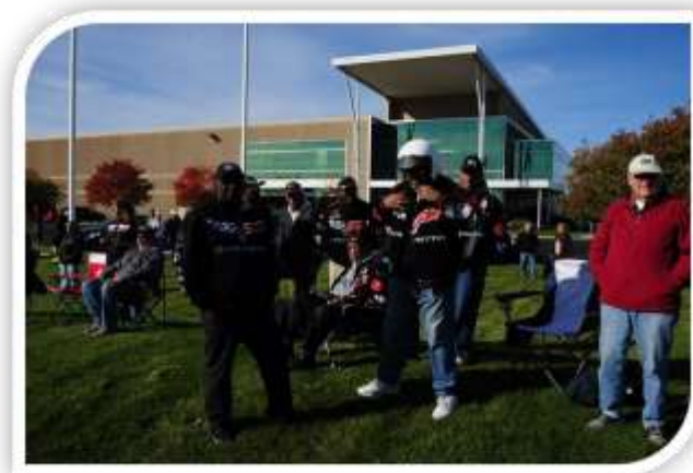
Low Speed Auto Crossing—Tire Rack October 2014

Tail of the Dragon http://www.tailofthedragon.com/