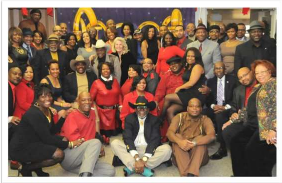
CCCC Group Photo—Christmas Party December 2014